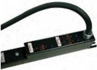
C13 Receptacle (Rated 15A)

A Hub assembly of a Power Commander Plus PDU showing circuit breakers and LEDs.