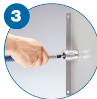
3 Slacken gland nut and insert prepared cable