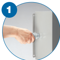
1 Install fitting on enclosure

When using a single conductor cable, an aluminum fitting must be used. TEK™ Teck Cable Fittings are easily installed, as no disassembly is required and there are no loose parts.