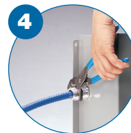
4 Hand tighten gland nut to hold cable, then wrench tighten