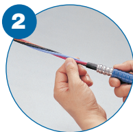
2 Prepare cable