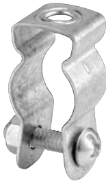
CICH-0404 / CICH-3232