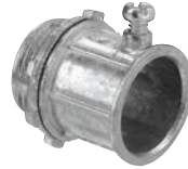
CI5004 (-IT) / CI5008 (-IT)