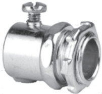
CI5404 (-IT) / CI5408 (-IT)