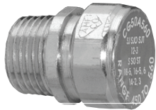
CICG50A250 / CICG150D1375