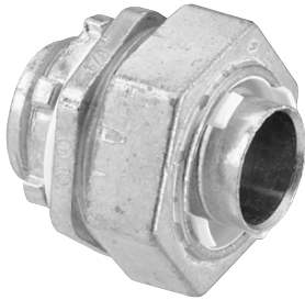
IT: with insulated throat