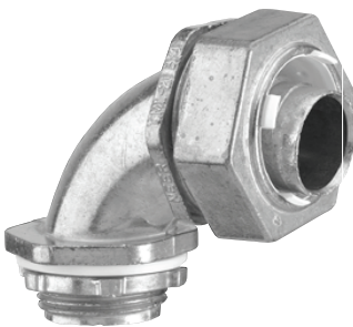
IT: with insulated throat