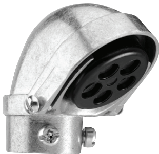
CIEFA-1/2 / CIEFA-4