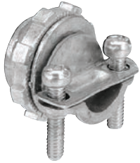
Zinc Die Cast Locknut