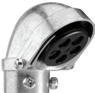
CIEFSA-1/2 / CIEFSA-4