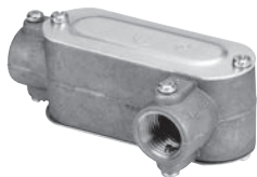
Combined LL/LR Left and right application