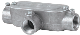
CITA-1/2 / CITA-2