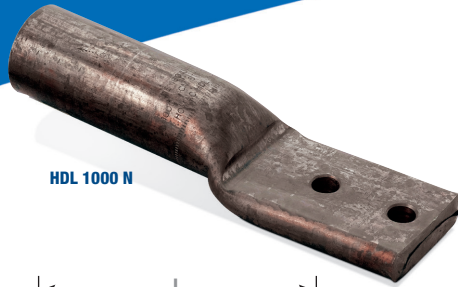
HDL 1000 N