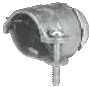
Zinc Die Cast Locknut