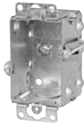
CI425 "Screwlok" brackets for rework installation. Max. wall thickness: 5/8 in.