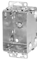
BC1102 Recessed ears.