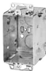
BC1104 Recessed ears.