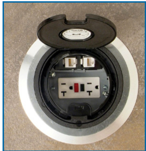
Power and Communications

When using the 68R Recessed Cover with the 68-P floor box for concrete applications, the entire box depth (6") is required. Prior to concrete pour, level the top of the box with the screed line of the concrete.