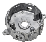
CIC-8444 / CIC-8448