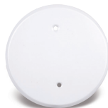
CCRB / CCRSB