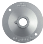
S-12 / S211BRE