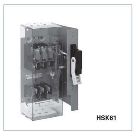
▲ Built to order. Allow 6–8 weeks for delivery.