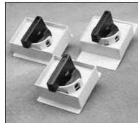
Rotary Switch Direct Mount Handles