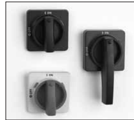
Standard Duty Rotary Switch Door Handles