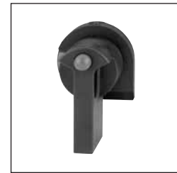
Heavy Duty Rotary Switch Door Handle