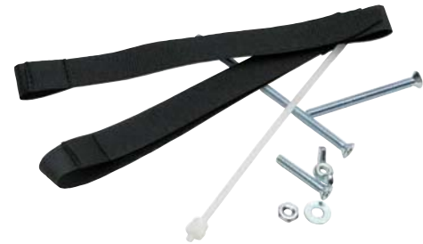
Splice Tray Mounting Hardware Kit