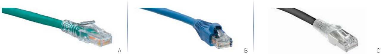
[A] eXtreme® Cat 6 Component-Rated SlimLine Boot Patch Cord, CM (PVC)