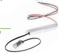
OSF10-IUW and OSF10-PPW

*Consult with factory for 208, 220, 230, and 240V models