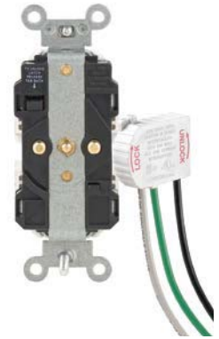
M5362-S with MSTWL-A