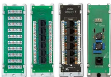
47689-00B, 47605-C5B, 46711-C6B, 47616-DSB