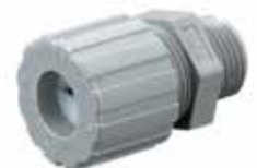
Gray Nylon Cord Connector