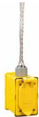
Deluxe Cord Grips (purchased separately)