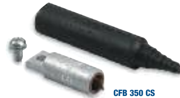
CFB 350 CS