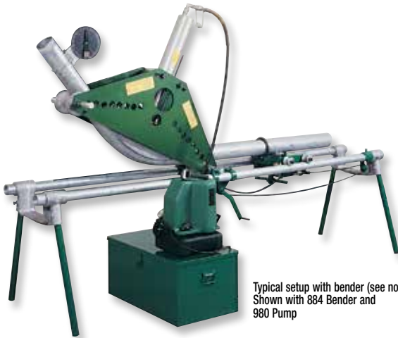
Typical setup with bender (see note) Shown with 884 Bender and 980 Pump