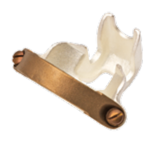
EKO -3D 9F61BKW398