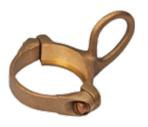
EK-3D and DD 9A61AWW612