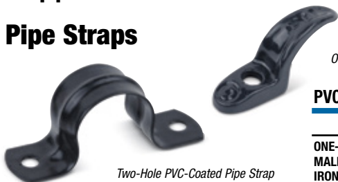
Two-Hole PVC-Coated Pipe Strap