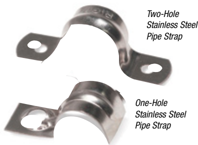
Two-Hole Stainless Steel Pipe Strap