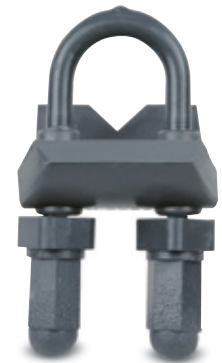
Right Angle (RA)