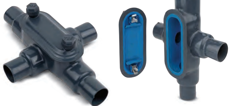
3/4 in. X Form 7 conduit body and cover