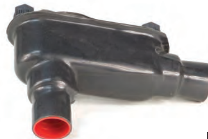
3/4 in. LB Mark 9 conduit body and cover