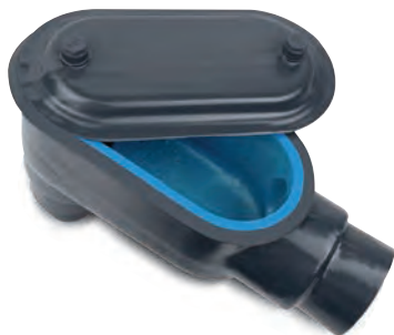
2-1/2 in. LB Form 7 conduit body and cover