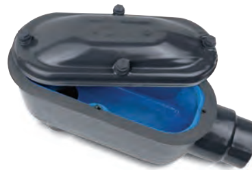
2-1/2 in. LB Form 8 conduit body and cover