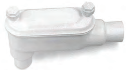
3/4 in. B Form 8 conduit body and cover