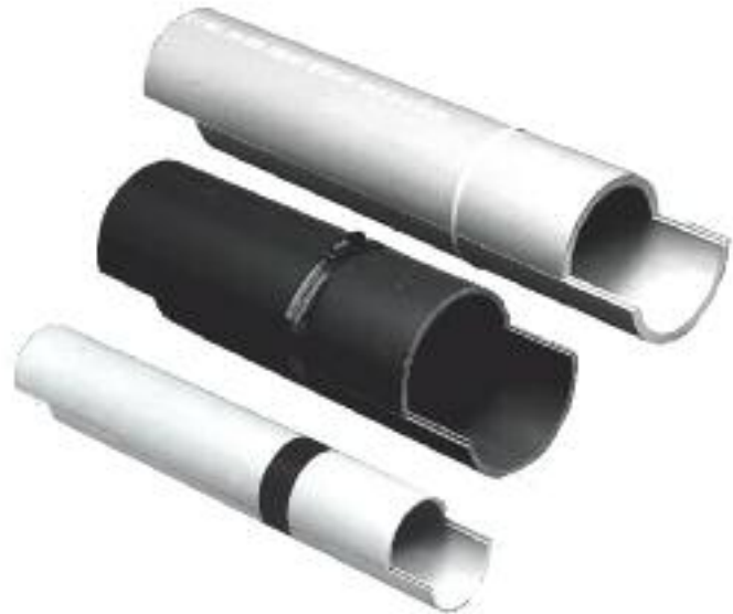
The fast and easy method of installing duct around existing cable for repair and temporary installations.

Verify with local inspection authorities before using.