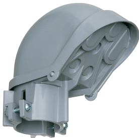
PVC105, PVC106, & PVC129