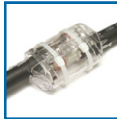
Clear, polycarbonate (UL94V-0) version available