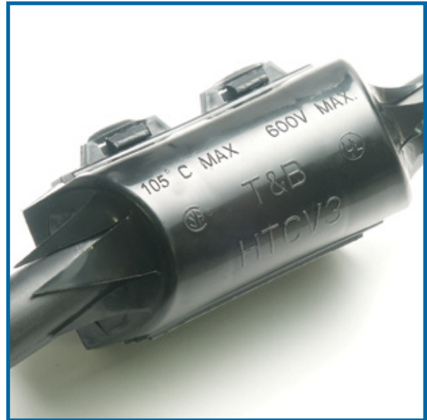
Smaller size requires less space in enclosure High-impact polypropylene for rugged, dependable use

Also available in clear, impact-resistant and flame-retardant polycarbonate (UL94V-0). The clear version includes an internal pocket for a visible identification label without opening the cover. Contact Customer Service for shipping and availability.