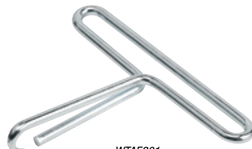
WTAE201 Tensioning Hook