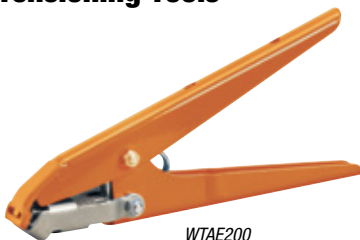
WTAE200 Cable Tie Tensioner