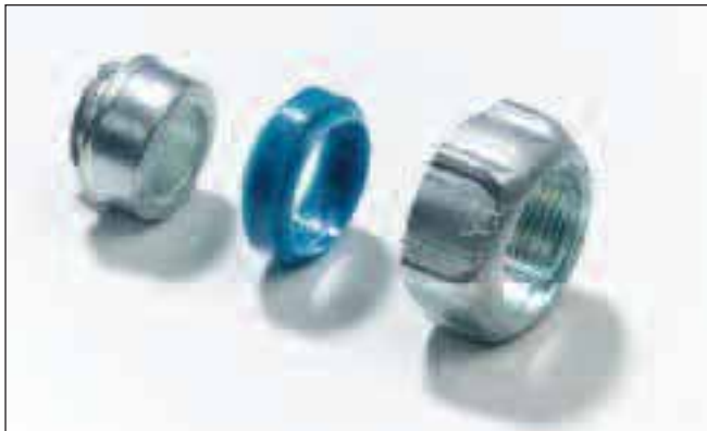
Fitting replacement parts