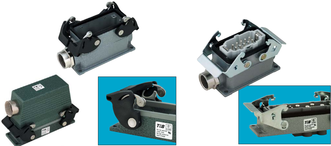
“E” type levers are standard for double lever B10 through B24 size housings. All single lever housings are constructed with metallic levers.

Benefits: Permanent marking with all data combined External marking vs. internal label