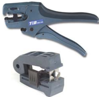
"V" Blade Cassette