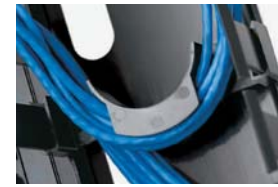
Mount the Slack Loop Organizer on the duct fingers to manage excess cables.