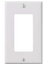
Inserts fit Decora Wallplates found on page D11.