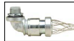
L7990 90° — Male