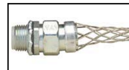
L7902 Straight — Male