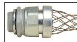
L7965 Straight — Male