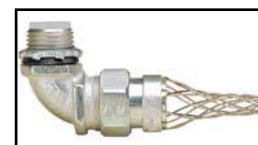
L7922 90° — Male