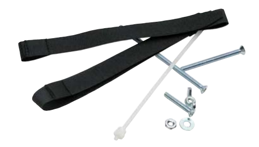
Splice Tray Mounting Hardware Kit