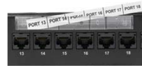
Magnifying Lens Holder

All Leviton Cat 6A/6/5e Patch Panels are RoHS Compliant