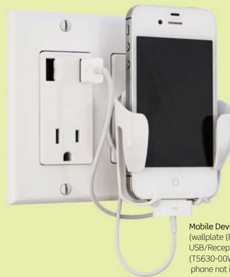
Mobile Device Station (wallplate (80409-00W), USB/Receptacle (T5630-00W), and phone not included)

See pages Q-30 to Q-31 for more information.