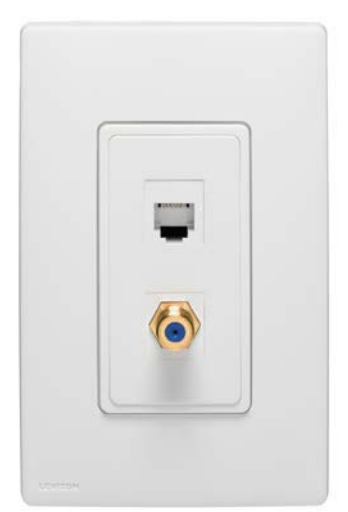
Renu® Wallplate and 2-Port Insert with QuickPort® Connectors