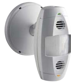
OSW12-M0W Wall Mount

Note: Use low-voltage wiring to connect sensors to OPP20 or OSPxx Power Pack or OPB15 Power Base Adapter