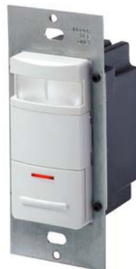
OSSNL-ID/OSS10-IN (Shown with Night Light on)