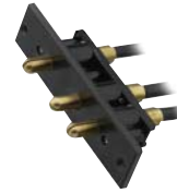
Male Panel Mount, Bolt-On