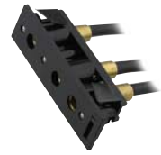
Female Panel Mount, Snap-In