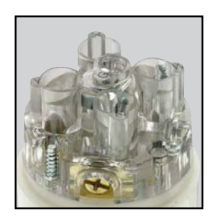
Deep-funnelled, large wire wells guide conductors into termination position.