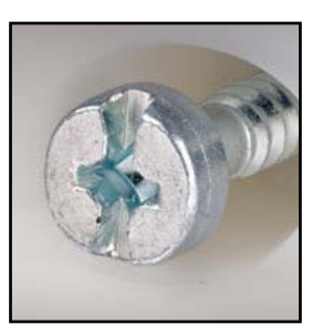
Shrouded pockets in cord clamp prevents slippage of screwdriver blade when tightening clamp screws.

Super tough nylon resists damage from severe impact, abrasion and chemicals