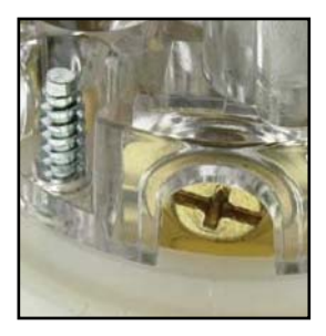
Captive terminal screws eliminate nuisance dropping and searching for missing screws.