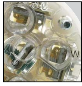
Wire clamps move within individual chambers to provide positive clamp lock without cutting wire strands.