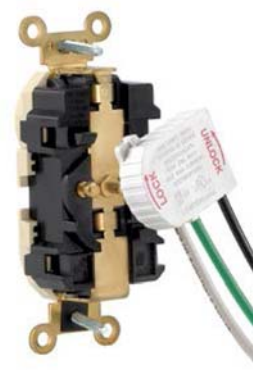
M5262-I with MSTWL-A