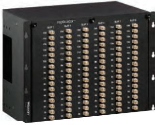
REPL-BRDE2400-LCMTDP0960M3C: Brocade 12/24k Replicator 8RU Enclosure, 96 channel, MTP® to LC, OM3, Fiber