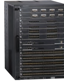
Unauthorized use not permitted