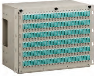
REPL-CSCO9513-LCMTDP5760M3C: Cisco 9513 Replicator 8RU Enclosure, Beige, 288 channel, MTP to LC, OM3, Fiber