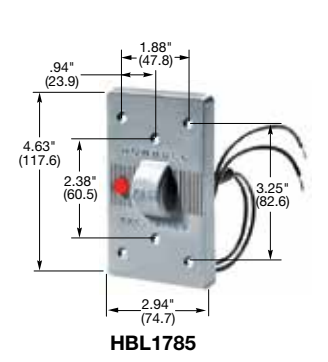
Dimensions in Inches (mm)