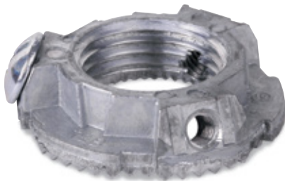
Grounding Locknut for Hubs